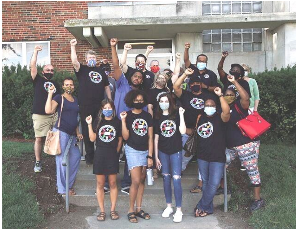
Pictured left: Members of Atchison United celebrate the street name change of Division St. to Unity St.

There is a LOT of education that needs to be happening with priests, educators